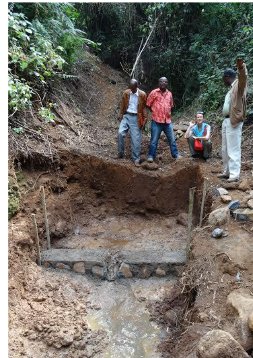
Komto Spring capping under construction

EEL continued to support the Nekemte Eye Clinic sending items of ophthalmic equipment and also funds for cataract lenses. Because of continued difficulties in retaining experienced staff it was decided to support a DASSC request for funding to train people from the Nekemte area as ophthalmic nurses and a nurse cataract surgeon. It is hoped to reach the fundraising target of £9000 early in 2014 and that training will start in September.