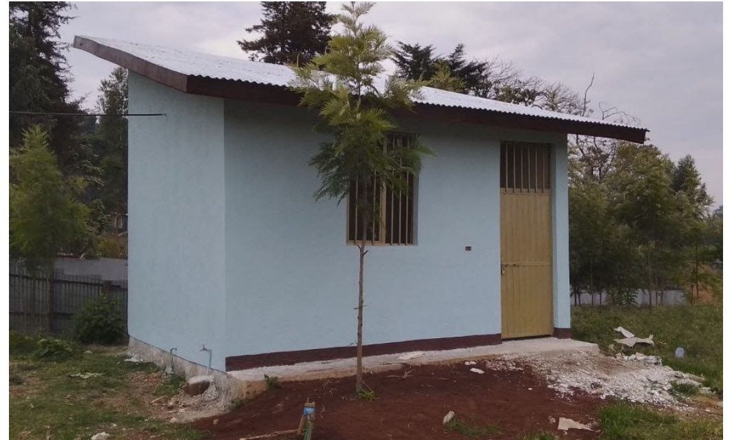
Lela Nekemte Sanitary Facilities