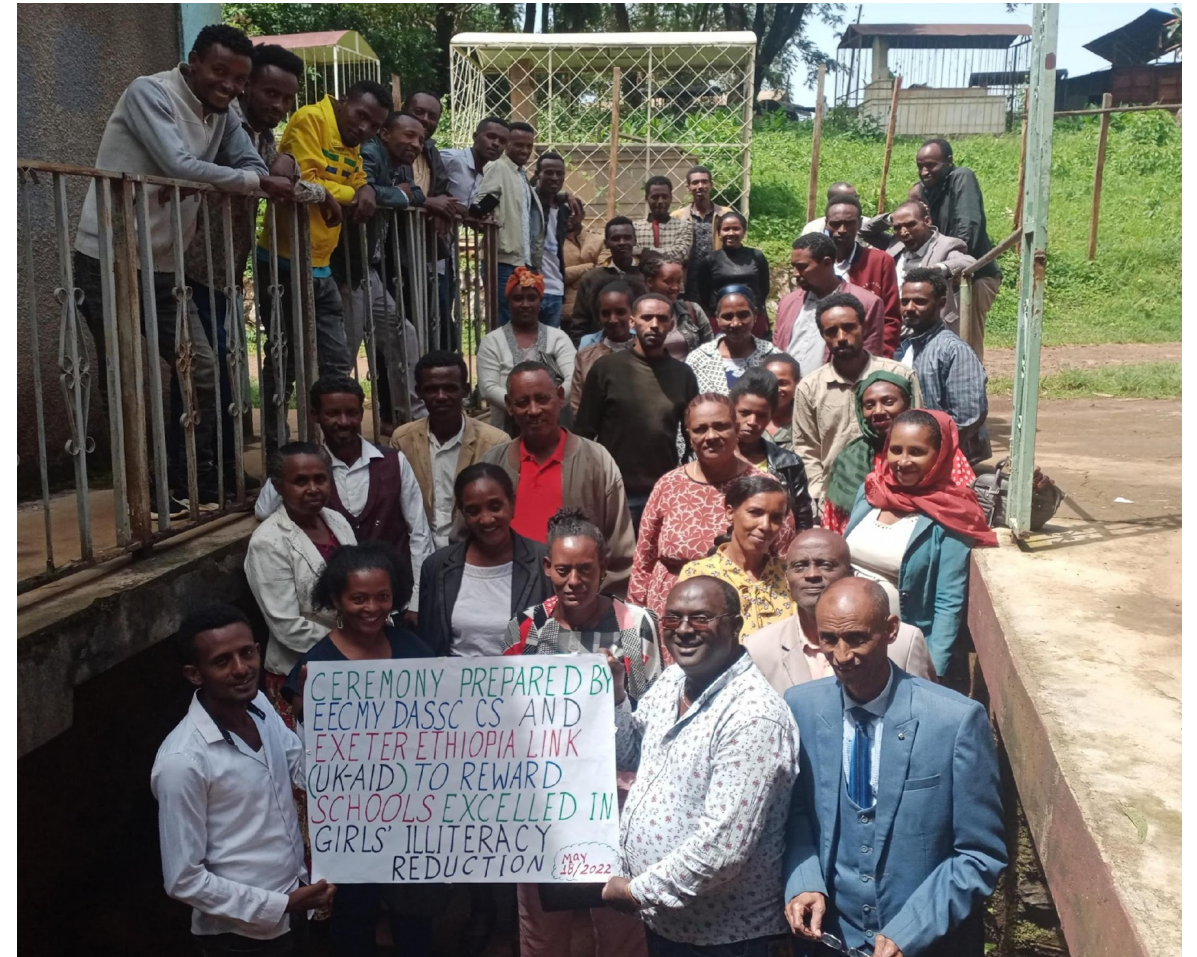
Thank you from the team in Nekemte & Librarians

However, EEL is continuing to work with the EECMY CS-DASSC. It puts the security of the team as a total priority but uses local knowledge to identify areas where it is safe.