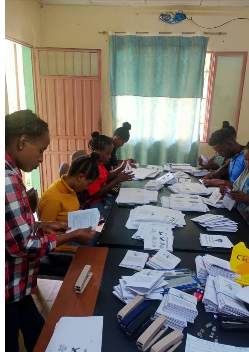
Deaf Students Making Books